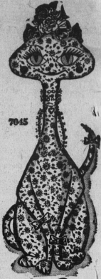
by Alice Brooks

United States had the largest merchant shipping fleet in 1906 with 2,986 ships, the U.K. was second and Norway third.