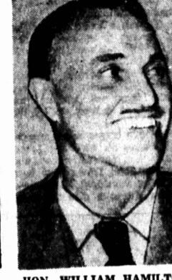
HON. WILLIAM HAMILTON Postmaster-General