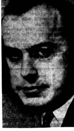
HON. LEON BALCER Solicitor-General