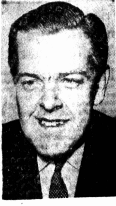
HON. DAVIE FULTON Justice