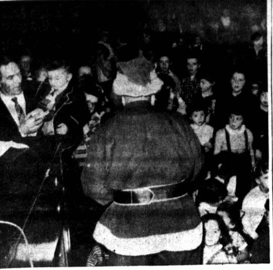
R.C.A.F. ASS'N SANTA