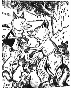
They will be all right, so don't worry," Reddy would say.

AN ANXIOUS PAIR Anxiety and love are twain, When dear ones suffer fright and pain. —Old Mother Nature. Over in the Old Pasture Reddy Fox and Mrs. Reddy had their home. It was one of the best homes they ever had had. They had raised a family the year before, and one the year before that. Now they had five lively young cubs playing about the doorstep, and getting their first lessons in hunting and other things a young fox must know before setting out for himself in the Great World. Reddy Fox is a good father. Mrs. Reddy is a good mother. No better parents live in the Green Forest, the Old Pasture, or on the Green Meadows. While the