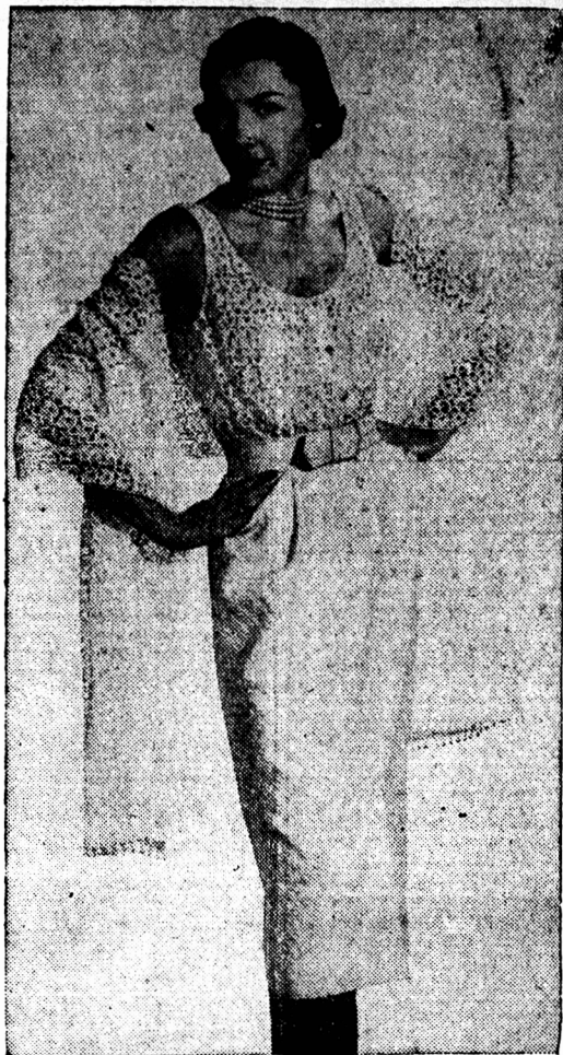
Important and beautiful Schiffli Venise lace is combined with pique in this afternoon dress with a plus stole for after-five hours (Ciro).