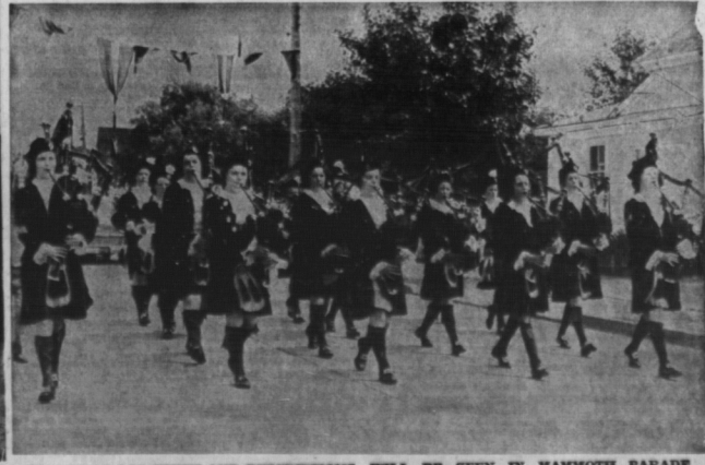
BANDS OF ALL TYPES AND DESCRIPTIONS WILL BE SEEN IN MAMMOTH PARADE