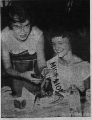
LOBSTER REIGNS SUPREME