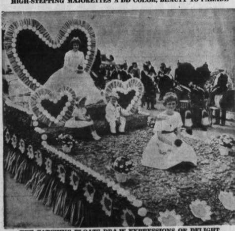
EYE CATCHING FLOATS DRAW EXPRESSIONS OF DELIGHT