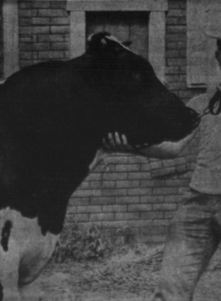
THE LIVESTOCK EXHIBITION IS A RATHER NEW, BUT HIGHLY VALUABLE ADDITION