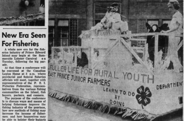
ISLAND'S YOUNGER FARMERS DISPLAY WARE IN PARADE