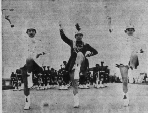
HIGH-STEPPING MAJORETTES ADD COLOR, BEAUTY TO PARADE