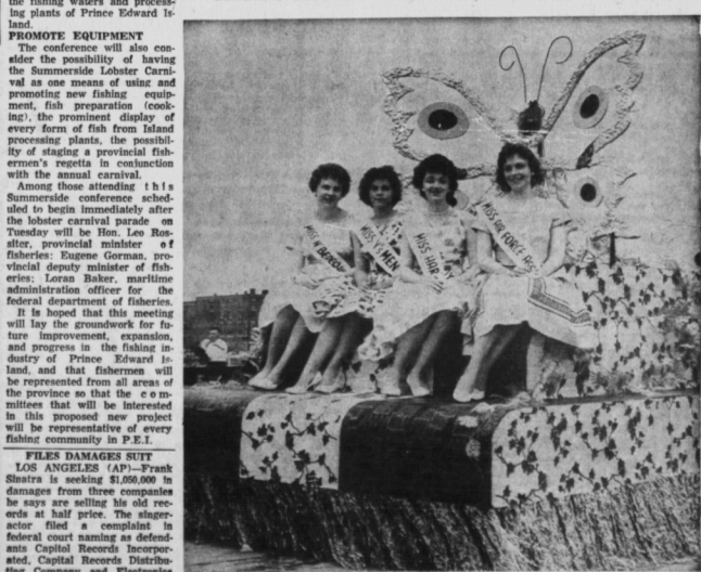
AND EVERYWHERE, BEAUTIFUL PRINCE EDWARD ISLAND GIRLS