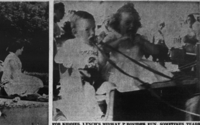
FOR KIDDIES, LYNCH'S MIDWAY PROVIDES FUN, SOMETIMES TEARS