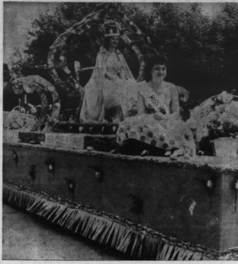
THOUSANDS WILL THROG ROUTE OF PARADE