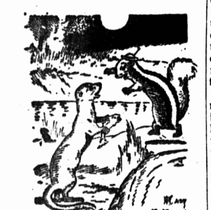
"I'll take that fish, cousin," said he.

"It's mine!" snarled Billy Mink. "It isn't either. I found it," spoke up Shadow the Weasel, and his voice was a snarl too. Billy Mink was getting ready to plunge into the water with that fish, knowing that neither of the other two would follow him. Jimmy Skunk suddenly stamped with his front feet. At the same time he threw his tail up over his head, and twisted his body around in the way he usually does when he uses his little scent gun. He didn't use it now. He was merely trying to scare Billy Mink. It did startle him so that he dropped the fish. Instantly, Jimmy Skunk pounced on it.