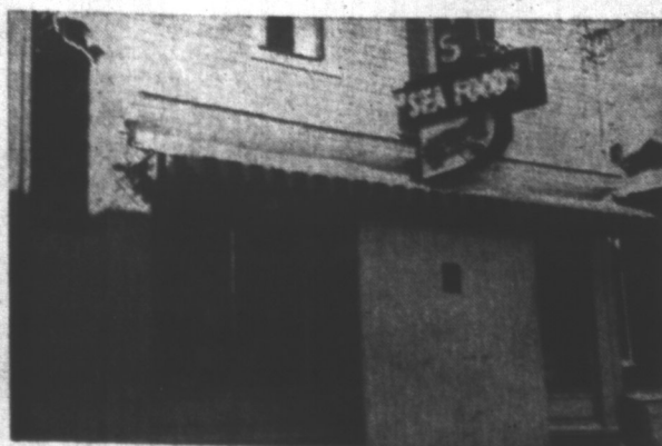
Andy's Sea Food Restaurant.

"delicious foods . . . served excellently"