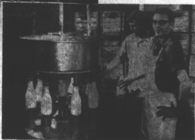
Pictured above is our Plate Cooler, Homogenizer and Pasteurizer.

On New Years Day 1938 we did our first Days Business . . . Since then our progress has only been made possible through the continued increasing patronage from our many customers. We now have 6 trucks and have 6 products which are: Pasteurized Milk, Homogenized Milk, Chocolate Milk, Blend, Whipping Cream Table Cream.