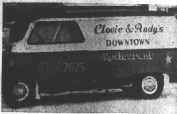
Andy's Downtown Restaurant