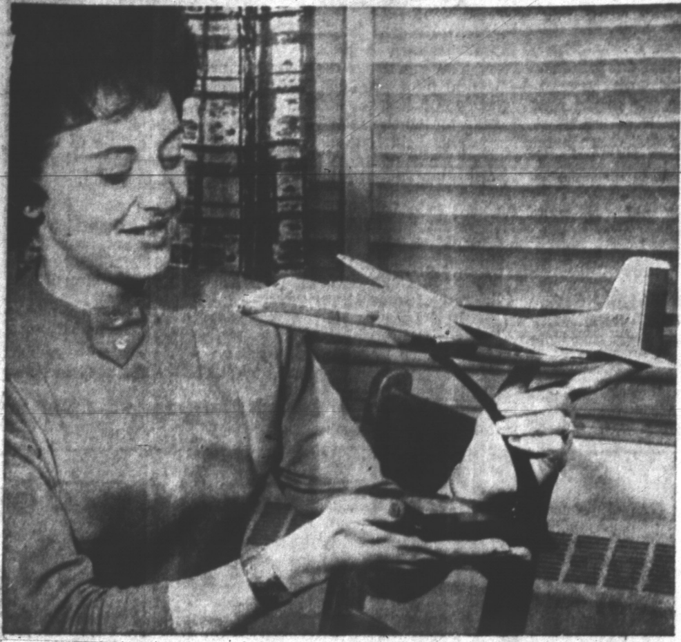
DAET-HERALD TURBO AIRCRAFT TYPIFY MCA'S FORWARD LOOK