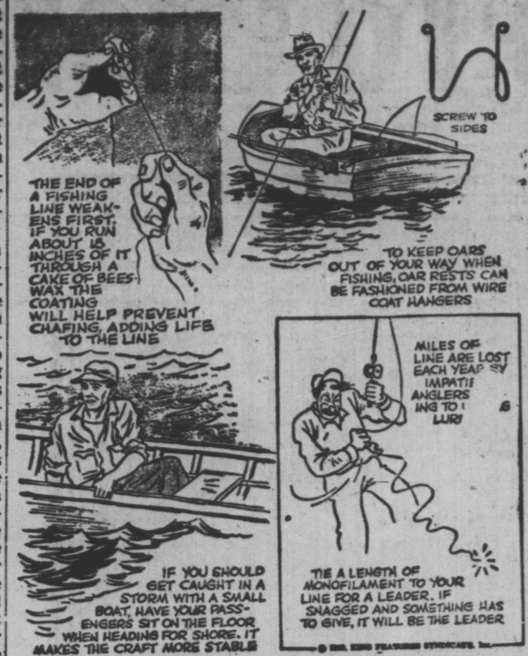
THE END OF A FISHING LINE WEARS FISHING LINE. IF YOU RUN ABOUT IT, IT WILL BREAK. IF IT BREAKS, YOU WILL BE LEFT WITH A CAKE OF BEES. WAX THE COATING. IT WILL HELP PREVENT CHIPPING, ADDING LIFE TO THE LINE.