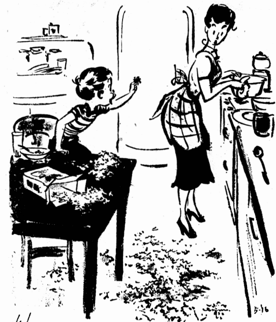
"See, Mom, I told you there was a toy somewhere in this box of cereal!"