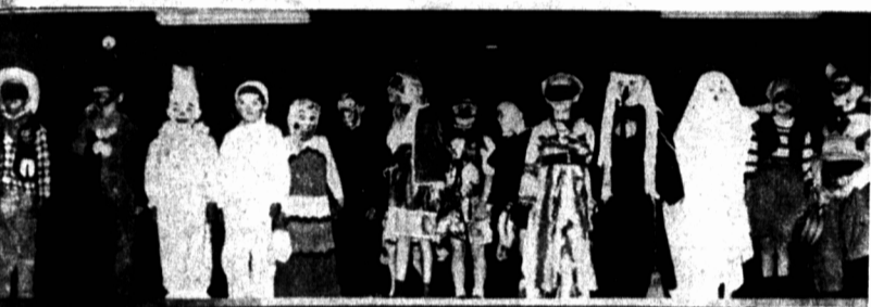
A class of junior grade pupils giant Halloween party held for the school children of Montague School auditorium. The photograph being judged at the

The objective of the current campaign of the Kings County Memorial Hospital, (top), which is now underway, is for $60,000. The photo above shows the well equipped, adequately staffed institution, and beautiful new Nurses Residence (below) which was recently added through the generosity of interested citizens and others. The operation of this institution costs an average of $7.50 per patient per day, although those requiring its services only pay an average of $5.50 per day. A large part of the operating deficit must be made up through the generosity of the people of Montague and surrounding areas who use these facilities. It is the desire of the board to maintain its present low rates, so that the cost will not be prohibitive to any one requiring hospitalization.