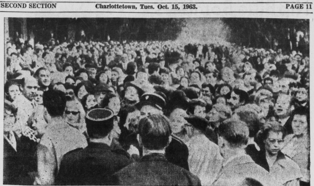
EDITH PIAF'S FINAL AUDIENCE Parisians crowd into the entrance to Rue Lachaise cemetery in the French capital for the funeral of singer Edith Piaf Monday. The 47-year-old Miss Piaf died Friday after a long series of illnesses.

CONNIE STEVENS WED HOLLYWOOD (AP) — Friends say actress Connie Stevens and James Stacy are spending their honeymoon in a mountain villa in Mexico. The blonde actress, who starred in the television series Hawaiian Eye, and Stacy were married Saturday. It was the first marriage for Miss Stevens, 24, and Stacy, 27.