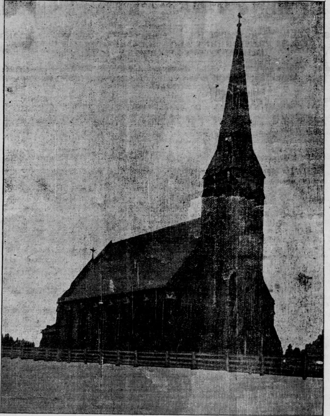
L'EGLISE DE TIGNISH.

Lors de la convention des acadiens, à Church Point, le Sénateur Poirier a prononcé un discours magistral, dont nous en donnons le texte dans un prochain numéro.