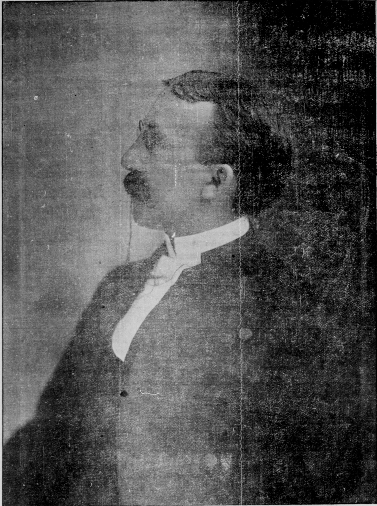
L'HON. PASCAL POIRIER, SÉNATEUR.

Lors de la convention des acadiens, à Church Point, le Sénateur Poirier a prononcé un discours magistral, dont nous en donnons le texte dans un prochain numéro.