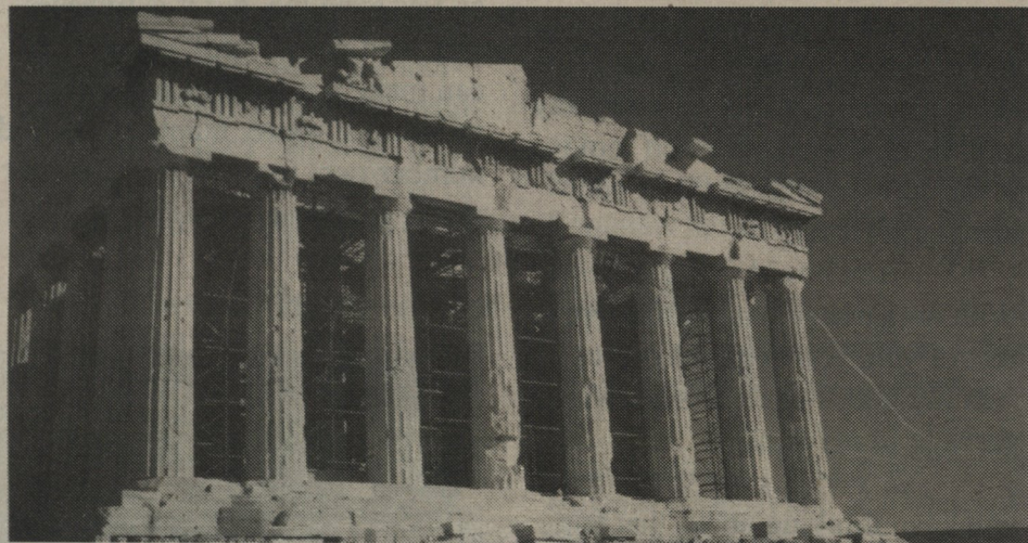
The Acropolis in Athens - Centrepiece of the city

Greece is a shock to the system but can not be skipped over. The mainland is great to see for its ancient wonders; however, the true beauty of Greece lies in its Islands. The water is as blue as you can imagine. The people are tremendously friendly. The lifestyles are relaxed, open, and very comfortable. If you desire to truly let loose and forget about life in Canada, then the Islands are right for you. As a warning, everyone will plan to only spend a couple days in the Greek Islands, but I promise you will not want to leave.