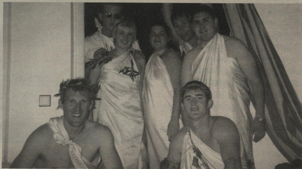
Standard issue pink togas - required every Saturday at the 'Palace'