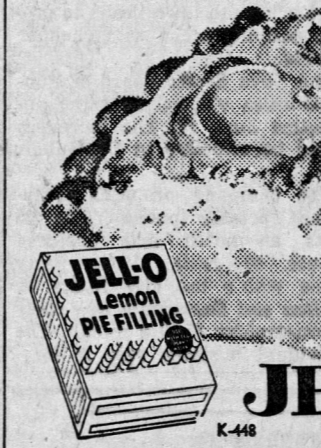
JELL-O Lemon Pie Filling