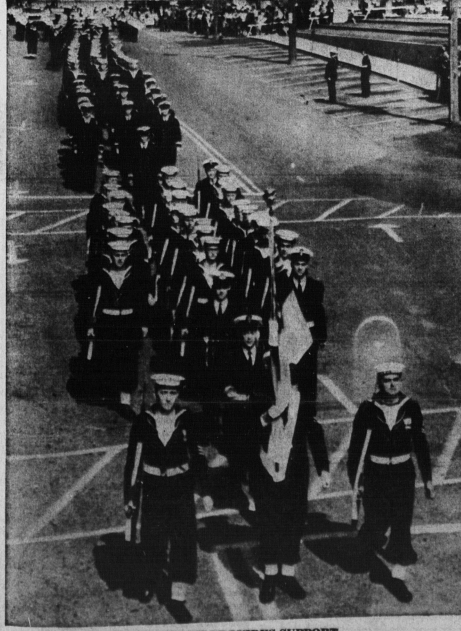
VISITING NAVY PROVIDES SUPPORT

PM SAYS (Continued from page 1) He said he had told the party leaders at their meeting Thursday that the government would look upon each of the flag debate votes as "entirely free votes." "An election will not be held on such votes," he added. "Parliament will make its decision by the individual vote of each member." Mr. Pearson said the party leaders meetings had tried to reach agreement on a time