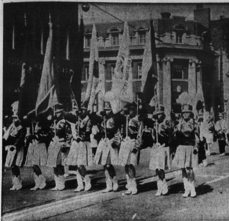
SNAPPY KATAKADIN RANGERS FROM MAINE DRAW RAVES