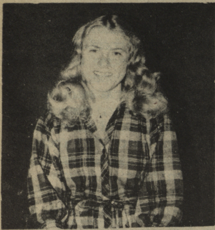
by Nancy Comeau

Scholarships, grants bursaries, and loans are available for YOU!