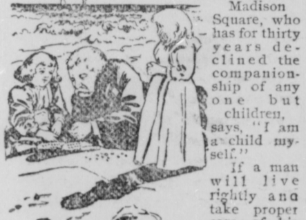
George Francis Train, the famous sage of Madison Square, who has for thirty years declined the companionship of any one but children.

If a man will live rightly and take proper care of his health during youth and maturity he may live to a green old age, and still be able to say with absolute truth, "I am a child myself."