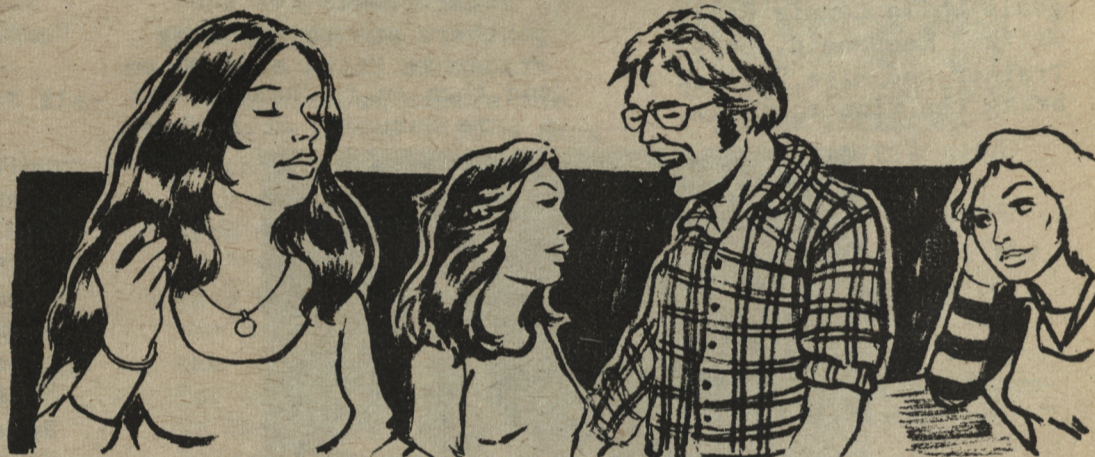
where's the bromo