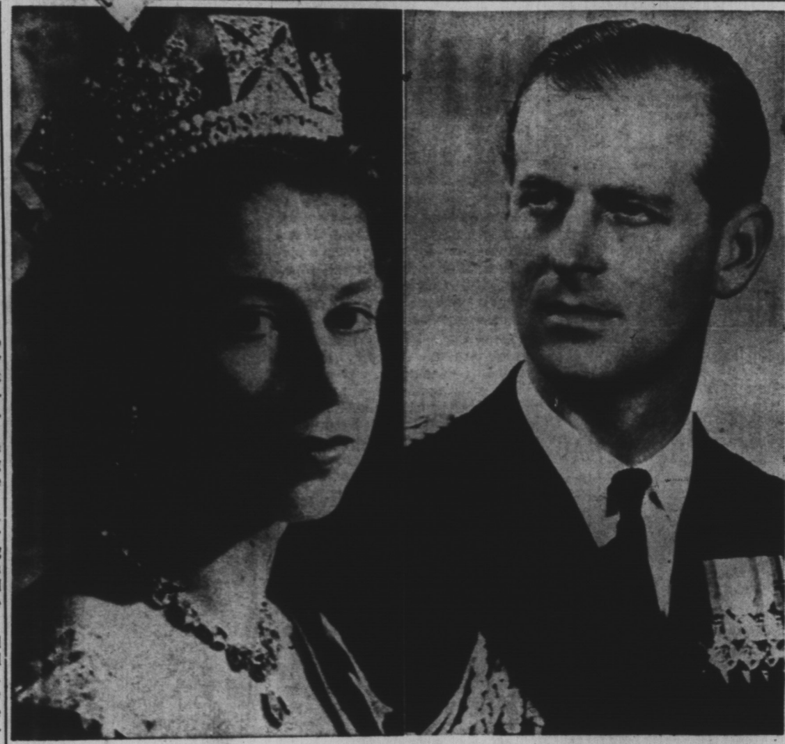
HER MAJESTY Queen Elizabeth II and His Royal Highness Prince Philip will spend 12 hours on the island when they arrive at Charlottetown by the Royal Yacht Britannia Wednesday, July 29th. The royal couple will arrive at 10 a.m. from Shediac, N.B., and leave for Imgonish, N.S., at 10 p.m. the same day.

Drivers and motormen trudged back to work and buses and street cars began rolling again. Armed police and troops rode the cars and buses and guarded the stations. Rail and subway workers, already mobilized under previous orders, were at work as usual.