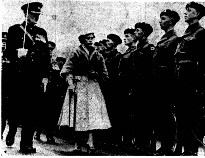
Princess Margaret is seen as she inspected a guard of honor at the 33rd Armored Brigade group base in Sennelager during her recent four-day visit to West Germany to inspect units of the British Army and Air Force. She is the first member of the royal family to visit Germany since the war.