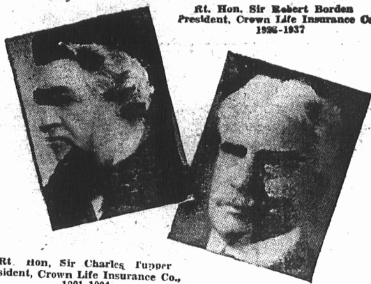
Rt. Hon. Sir Robert Borden President, Crown Life Insurance Co. 1896-1937

There are numerous trout fishing streams in the Park and at Rustico Harbour, Covehead Bay and Tracadie Harbour deep sea fishing parties can be organized. The Park is readily accessible by several motor roads and at Rustico by paved highways from Brudenell, Summerside and Charlottetown.