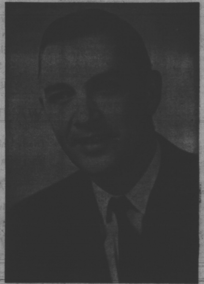
ALEX B. CAMPBELL, PREMIER

The advent of 1967 lends a particular excitement to this season of the New Year since we are on the eve of the achievement of many Centennial plans and occasions. The concept of the human community will be paramount over the next twelve months, and the visits and celebrations should lead us to a new awareness of our neighbors as fellow citizens united with us in furthering the progress and prosperity of our province and our country.