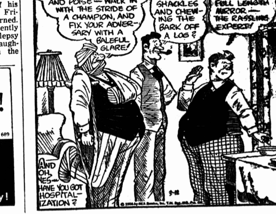
THANKS, ESPECIALLY YOU, MAJOR! GO TAKE A BREAK AT YOURSELF IN A FULL LENGTH MIRROR. THE RASPLING EXPERT!