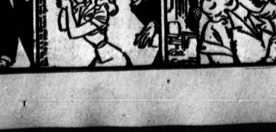
PHIL IS on a mission to a small island off the coast of Central America, when...