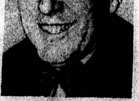
Canadian External Affairs Minister Lester B. Pearson (above) was defeated by Australia External Affairs Minister Percy C. Spender in the election of seven vice-presidents of the U. N. General Assembly in New York.

Defeated by Aussie For High U. N. Office Canadian External Affairs Minister Lester B. Pearson (above) was defeated by Australia External Affairs Minister Percy C. Spender in the election of seven vice-presidents of the U. N. General Assembly in New York. Spender won with necessary total of 30 votes—six more than Pearson had polled. Pearson's defeat removes Canada from a place of honor and also from a place on the assembly's strategic general or steering committee.