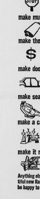
RAMBLER CLASSIC 770

Anything else you've ever wanted in a car? Look over the beautiful new Ramblers. Have a talk with your Rambler Dealer. He'll be happy to answer any other questions you have about cars.