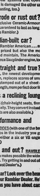
RAMBLER CLASSIC 770

Anything else you've ever wanted in a car? Look over the beautiful new Ramblers. Have a talk with your Rambler Dealer. He'll be happy to answer any other questions you have about cars.