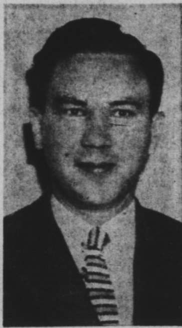
HON. MR. BONNELL

Free treatment of cancer by radiation and x-ray; establishment of rehabilitation centres at each of the Province's three larger hospitals; early construction of a school for retarded children; and organization of an emergency helicopter medical service for the residents of the Tignish area, were some of the immediate objectives of the department of health outlined in the Legislature yesterday by the minister, Hon. M. L. Bonnell.