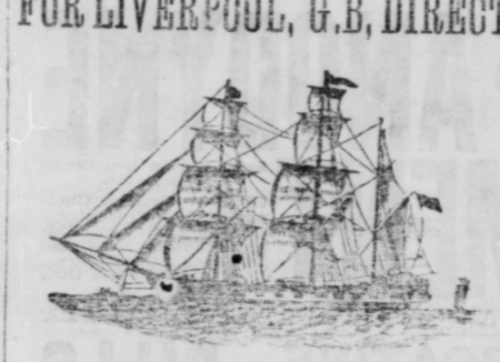
The famous Clipper Bark "MOSELLE,"

now here, will sail FOR LIVERPOOL DIRECT, About 20th May, and will carry Lobsters and other produce of the Island at cheap rates of freight. Apply to the owners, PEAKE BROS. & CO. May 6, 1886—3aw 11 dt.