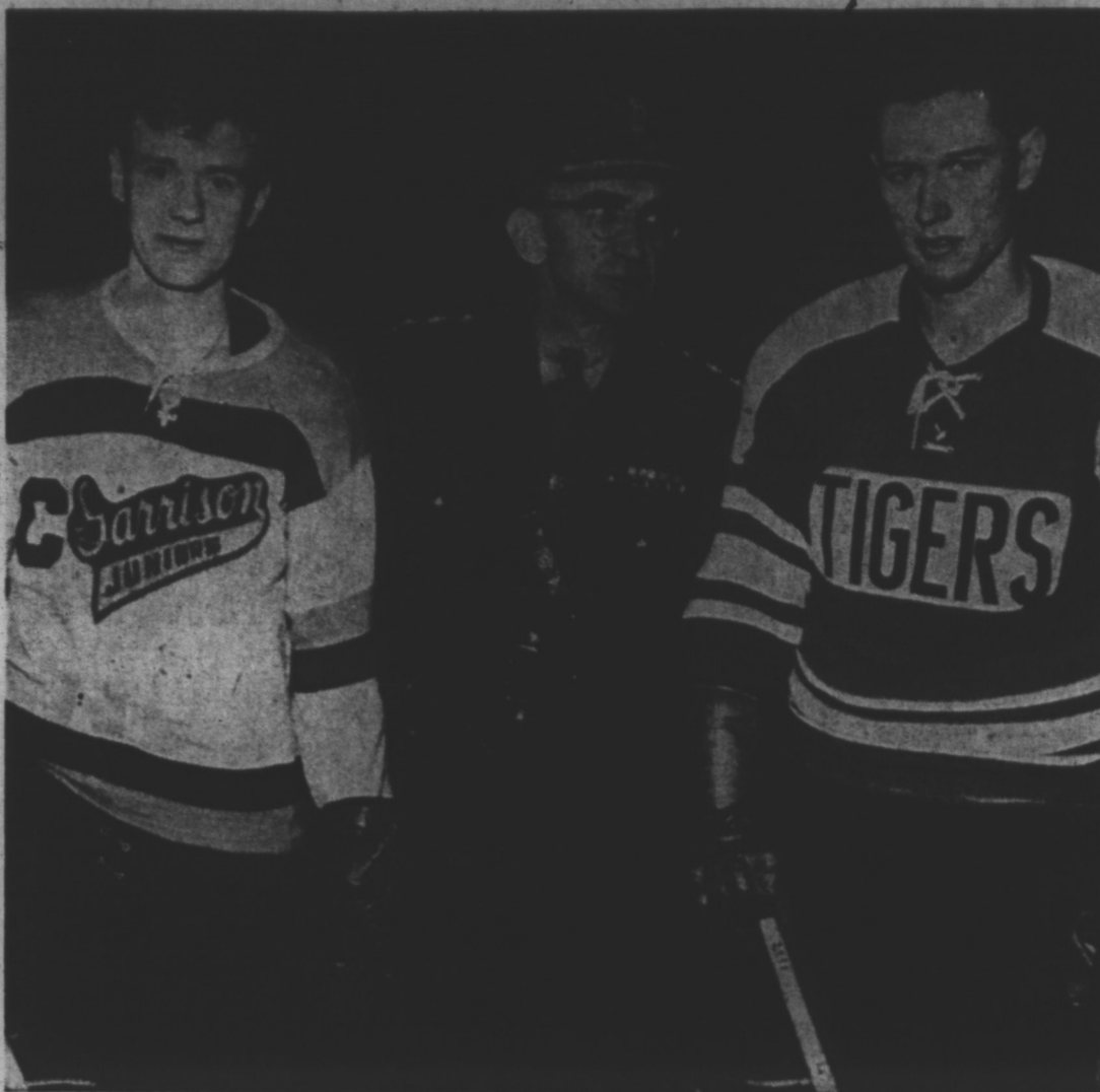
'ARE YOU READY?'

A jam-packed house is expected to crowd the stadium for the game that gets underway at 9 p.m.