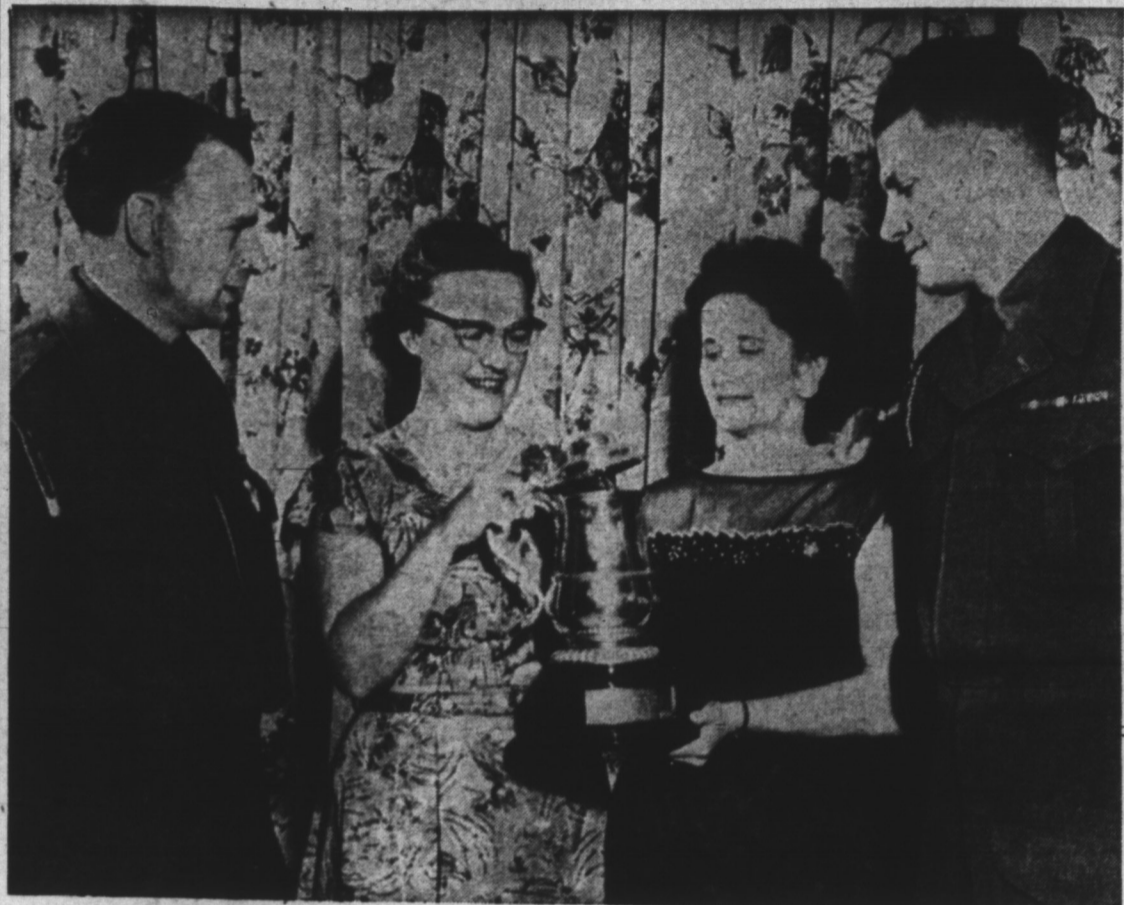
BEST SIGNALS UNIT IN CANADA

He was "satisfied" that insurance companies, from what he knew of them, would not make mortgage loans at six per cent. He noted that housing starts this year had dropped to an estimated 140,000 from 165,000 in 1958 and appeared to agree with a reporter's suggestion that this could reflect a scarcity of lendable capital.