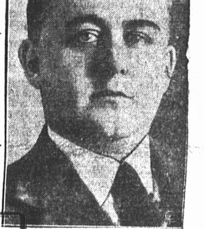
HON. FERNAND RINFRET

Vacating in California, the 56-year-old Cabinet Minister was