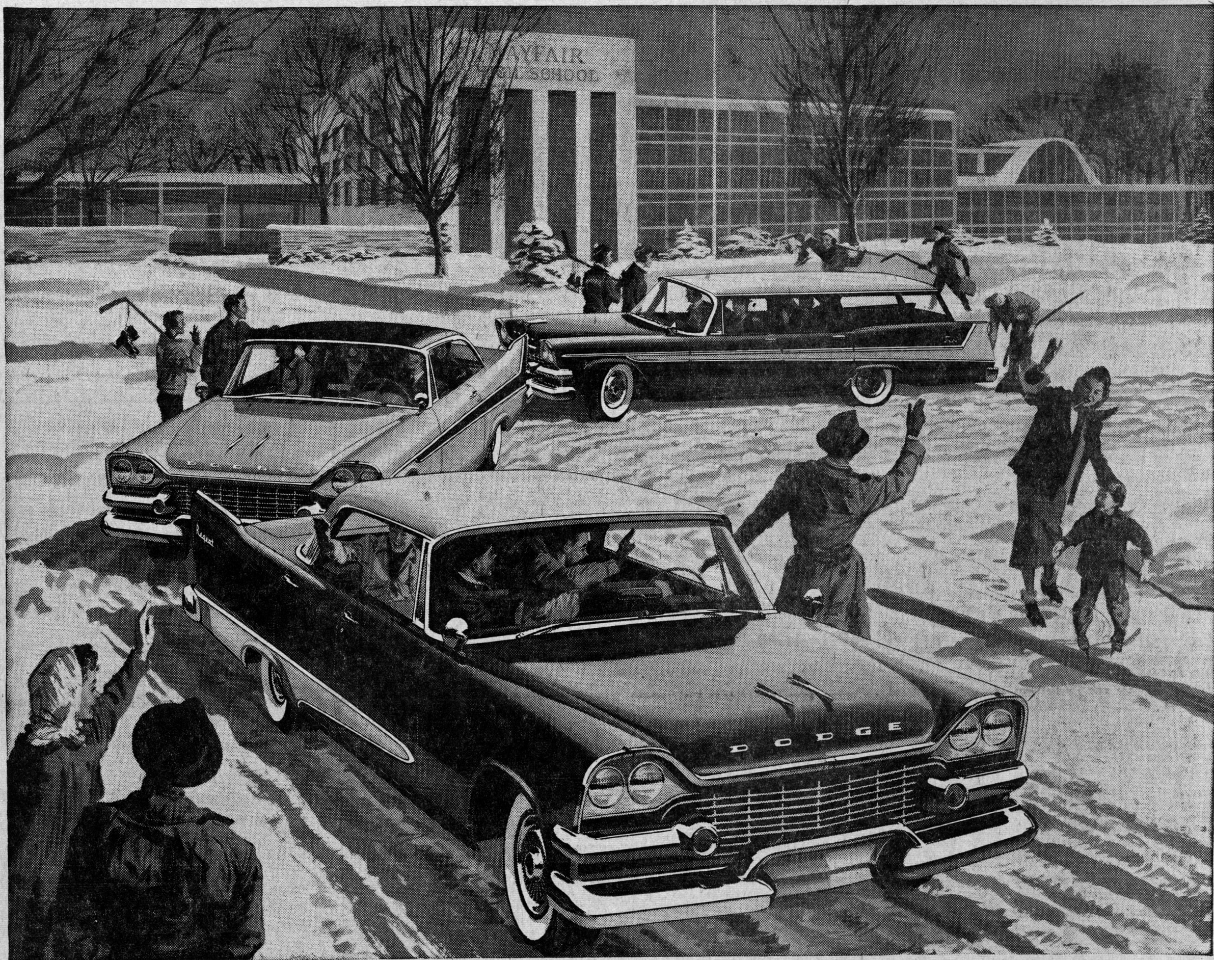
Illustrated: Front to rear, Regent 4-door hardtop, Mayfair 2-door hardtop, 4-door Sport Suburban. Just 3 of 21 beautiful Dodge models for '58!

A winter buy is the best buy... when you go with the winner! DODGE '58