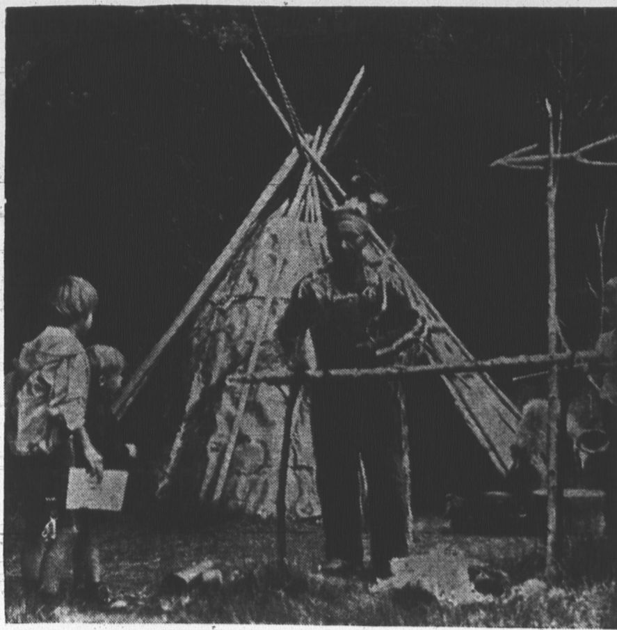
Mic Mac Indian Village located at Rocky Point, P.E.I.