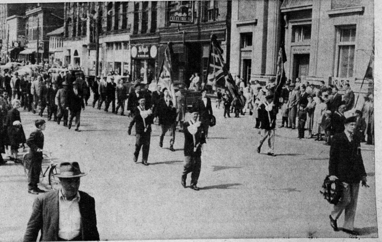
A SECTION OF THE PARADE

HOLLYWOOD (AP)—"Daddy, will you get mama that red blanket for Mother's Day? I don't suppose they'd let me out of here with this out on my leg."