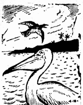
"The early bird catches the fish," said Brown Booby

"The early bird catches the fish," said Brown Booby as he flew past