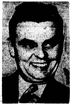
Mr. John Diefenbaker, M.P.

The development of electric power in all parts of the country as a national responsibility in co-operation with the Provinces was emphasized last night by Mr. John Diefenbaker, K.C., M.P. for Lake Centre, Saskatchewan.