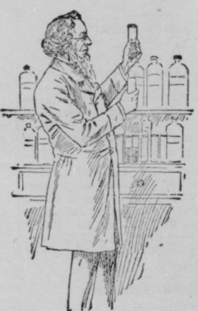
DR. A. W. CHASE AT WORK IN HIS LABORATORY.

"Having seen a paragraph in the Chit Chat column concerning a letter received by an Ottawa gentleman from a prisoner in Spain asking him to care for the prisoner's daughter, I beg to state that my father also received just such a letter from Spain about six years ago. I had heard of this fraud through London Truth, and so of course the letter was thrown aside. I thought nothing more of it until I heard of a friend in Ayr, to whom the same letter was sent, and as a sister of this friend had married a Spaniard he at once responded and sent the money to bring the supposed niece out. In the meantime he heard of others who had been similarly appealed to, and called just in time to stop payment. If you take the trouble to make inquiries you will find any number of people who know of this 'Spanish Swindling Co.' as it is called in Truth. For years they have been trying to bring the perpetrators to justice, but so far they have utterly concealed their identity. Will you not sound a warning note in your paper? It is a perfect fraud, and for my part I am surprised that people should be so easily taken in."