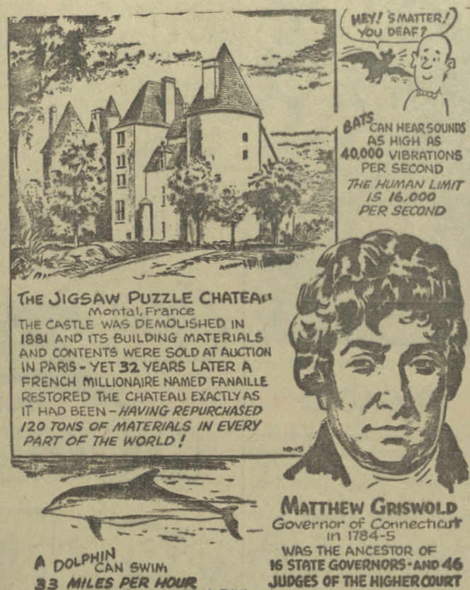
THE JIGSAW PUZZLE CHATEAU... MATTHEW GRISWOLD Governor of Connecticut