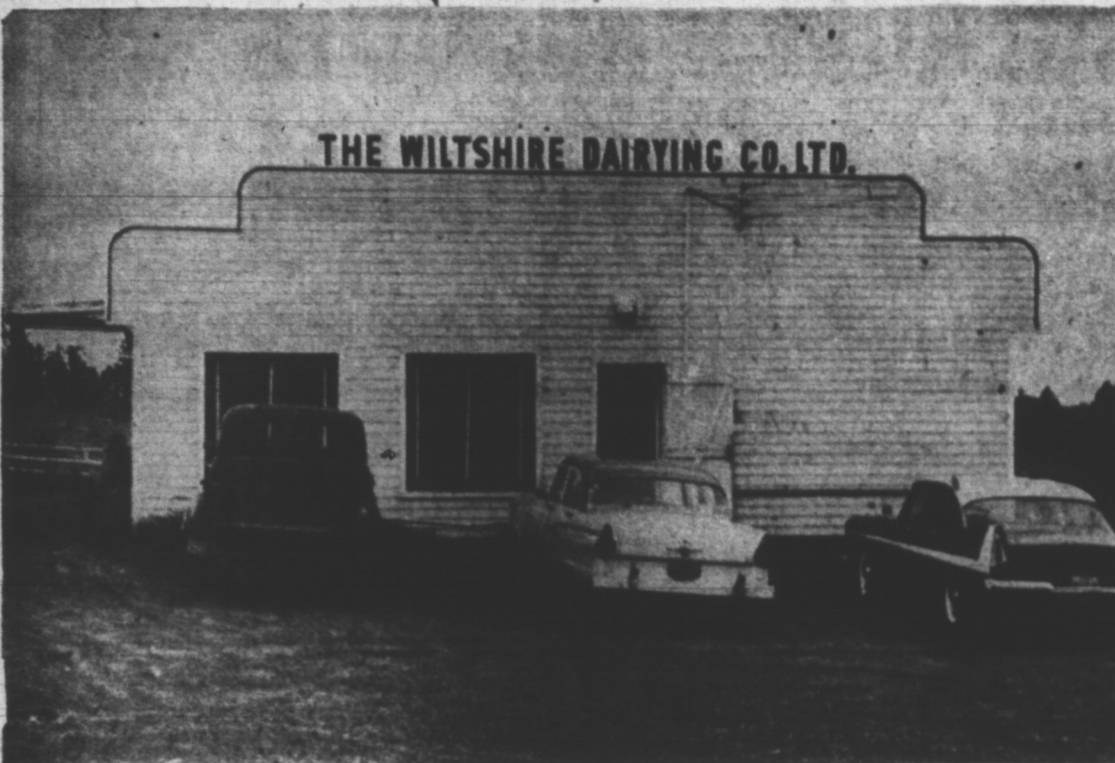
TYPICAL SMALL-CREAMERY IS OWNED BY FARMERS IT SERVES