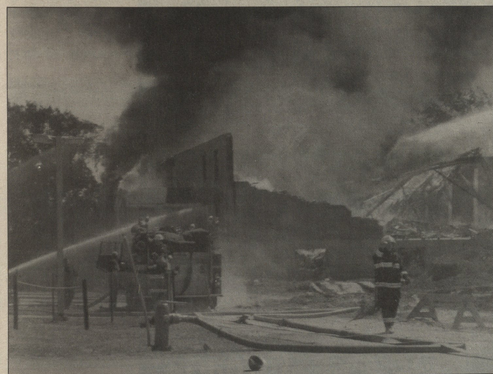
It's not so much the heat as it is the humidity.

The curry bratwurst comes in two sizes: one sausage or two. Either choice is accompanied by a mild, but very nice curry sauce, some inedible vegetables held together by what might be mayonnaise, and your choice of potato. I highly recommend the “German potatoes” which are beautifully greasy potatoes sliced and fried with onions. A lot of them. The meal, with the exception of the vegetable-mayonnaise catastrophe, is both large and excellent and is highly recommended.