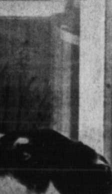
TRAVELS WITH FOUR-FOOTED EYES

The fire, between four and five miles long, was burning on a quarter-mile-wide front about three miles from Roseway, a village of 15 homes and several