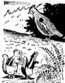
"What is your name?" asked Thunderer.

Thunderer the Grouse chuckled as from the end of a mossy old log he looked down on two small visitors. Thunderer had been drumming and these two small visitors had come to see him drum. They were of about the same age, but one was a little bigger than the other. Both wore striped coats. In this matter they were alike, but in this matter only. One had bright, snapping eyes. The other also had black eyes, but they were not bright and snapping. They didn't snap at all. The truth is they were a little dull. Their owner wore a black coat with two quite wide stripes. The other also wore a striped coat, but it was not black and the stripes were very narrow.