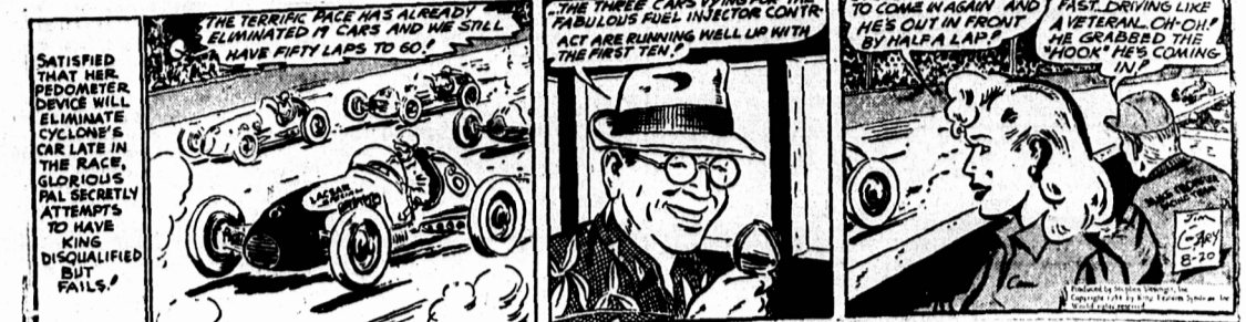
By Ham Fisher