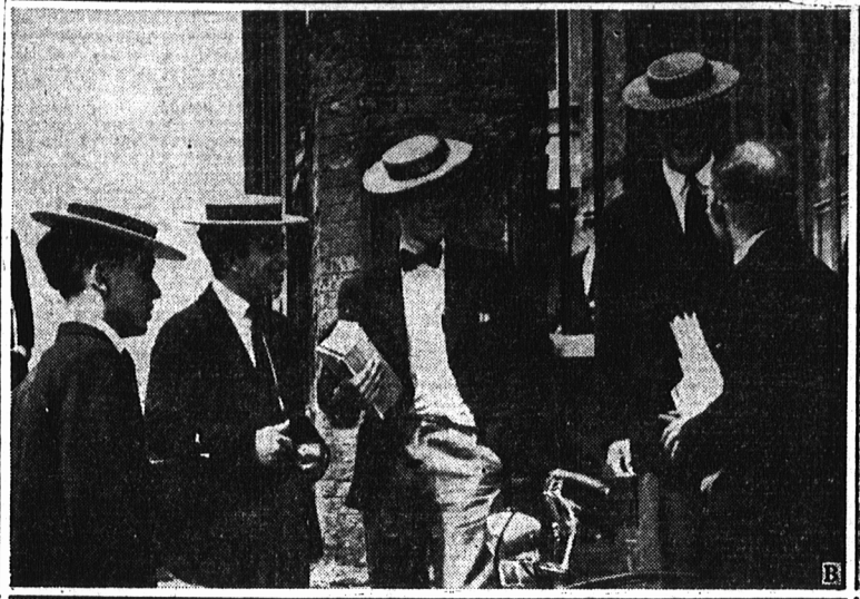
17-YEAR-OLD STUDENTS at Harrow, one of England's famous old schools, founded in 1572, were King Faisal of Iraq and King Hussein of Jordan. Both the young Arab rulers are pictured above with Harrow schoolmates and a teacher before Faisal (second from left) left on his recent visit to the U.S. Hussein (extreme left) recently succeeded his sick father King Talal to the Jordan throne. Through the centuries Harrow has built up a long list of famous former pupils, Winston Churchill being among seven British Prime Ministers.