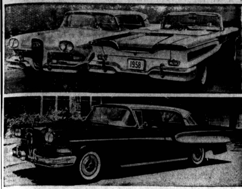
EDSEL IS ON DISPLAY

North America's newest automobile—the Edsel—will be on display in dealer showrooms throughout Canada on September 11. Ford of Canada announced yesterday. The Edsel will be available in 17 models in four series—the lower priced Ranger and Pacer and higher priced Corsair and Citation. The distinctive appearance of this new line of cars, which makes