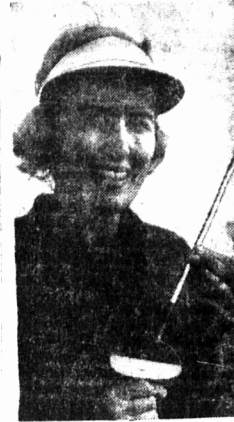
Tournament pro Betty Jameson recently found a new putter that affords her considerable confidence on the greens. Many golfers claim that confidence is the biggest part of putting. It surely helps.

When your head moves you are proving that you have no confidence in what you are doing.