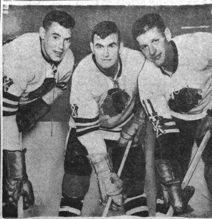
LEAF ALUMNI REUNITED