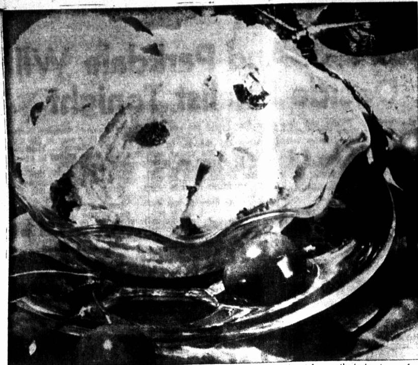
DESSERT OF THE MONTH—way of cherry vanilla ice cream, it out frequently to treat your fam- Cherries in March? You bet... by A dessert special this month, spoonily to June-in-March flavor.