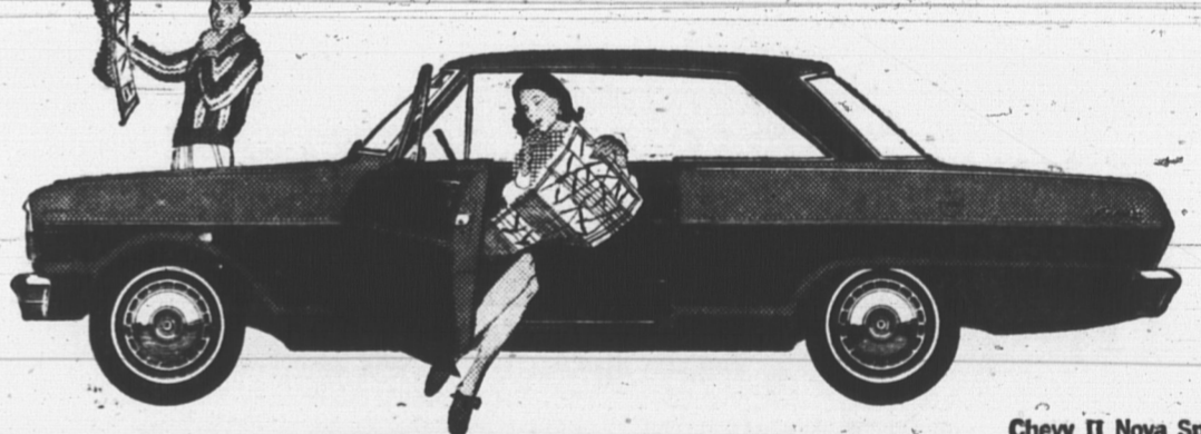
Chevy II Nova Sport Coupe

See Chevelle for style! See your Chevrolet dealer for savings