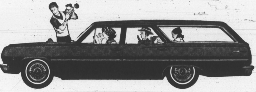
Chevelle Malibu 4-Door Station Wagon

See Chevrolet for luxury! See your Chevrolet dealer for savings