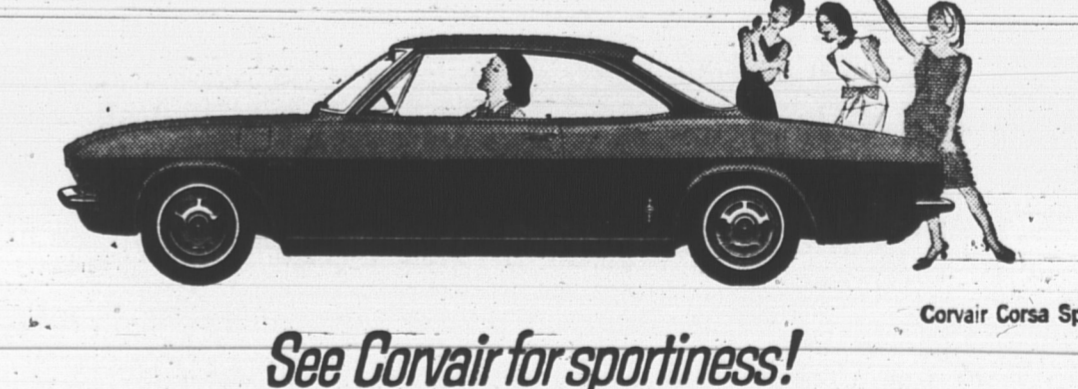
Corvair Corsa Sport Coupe

See Chevy II for thrift! See your Chevrolet dealer for savings