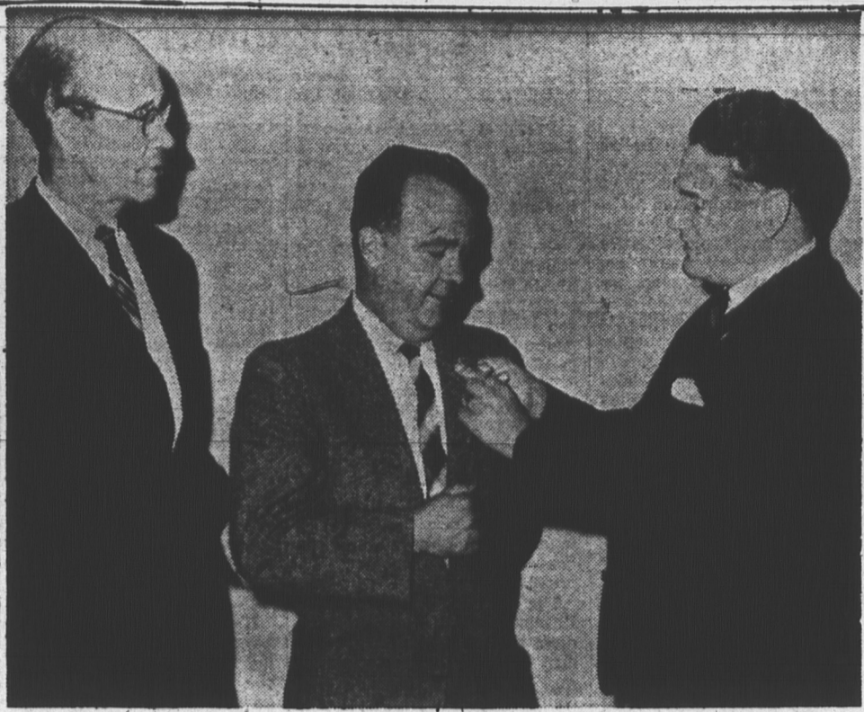
HONOR PAST PRESIDENTS