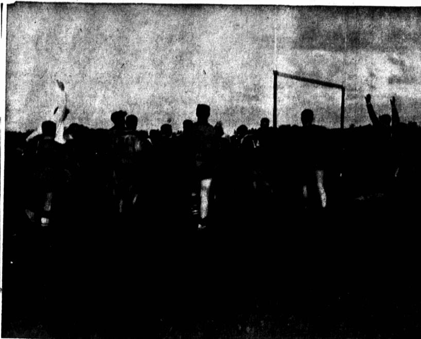
Referee Cy MacIsaac raises his arm signifying a score in a game. The Saints went on to power the Engineers 21-3.

to put Christ back into Christmas. The Roman Catholic priest protested against the type of cards coming on the market. Two of his parishioners dramatized the campaign by buying up and burning all cards in the town carrying slightly off-color jokes.